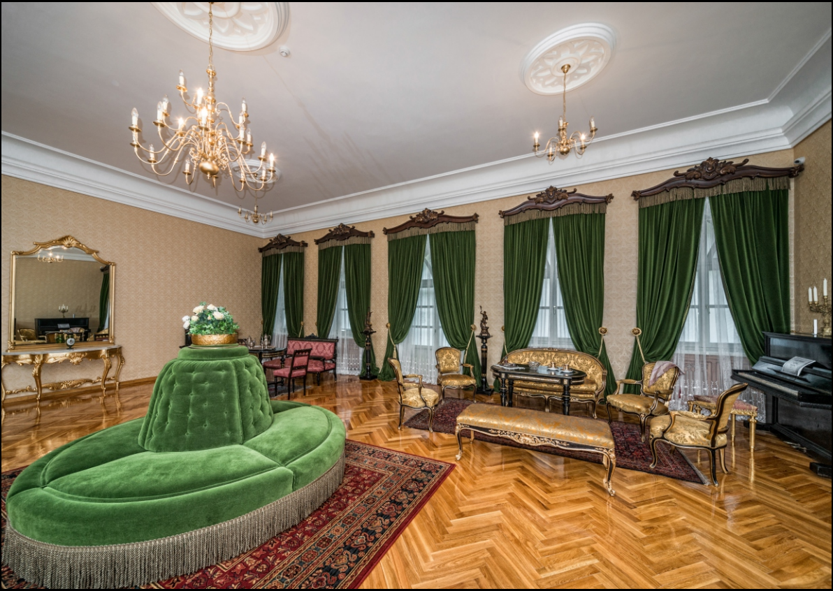
Decorative Side Panels | Pelmet | Valance | Decorative Top Treatments | Curtain Tracks & Fixing Systems